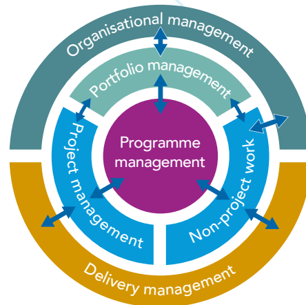
Figure 1 illustrates the typical hierarchy of portfolio, programme and project management, supported by delivery teams. Reviews are held at each level, with differing emphasis on steering, leading and managing.

data and put it to the back of the pack, with decisions being made on gut instinct."