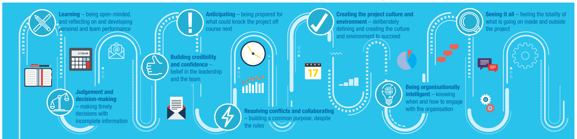
Figure 2 illustrates APM Project leadership behaviours

Costain's approach to improving leadership behaviour requires clear interventions to be made. First the behaviours you want to increase or decrease need to be identified. Claire: "We use a systematic, data-based approach to specifically pinpoint behaviour. We identify the prompt and analyse the