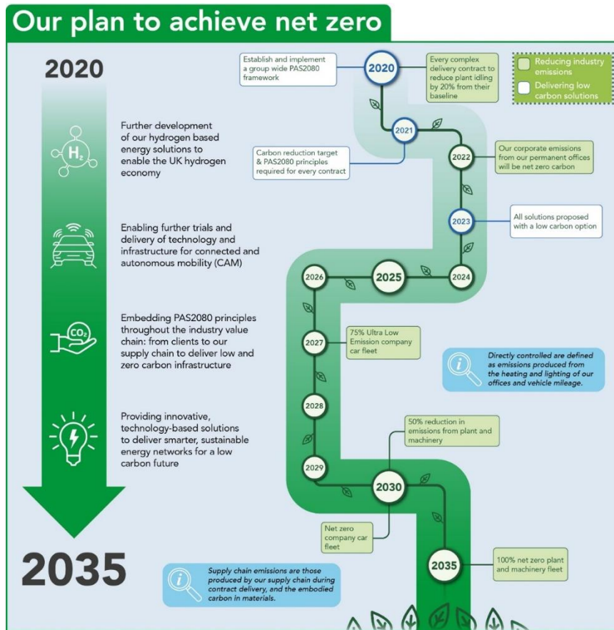
Figure 1. Costain Group PLC Climate Change Action Plan targets.

The breakdown of our Group footprint per scope can be seen in the figure 2 below. For the second year, we have included the embodied emissions of our most carbon-intensive materials: concrete, steel, aggregate, and asphalt within our Scope 3 emissions. In 2022 we increased the number of supplier-sourced data included within our purchased goods and services boundary, creating a 33% increase in emissions relating to goods and services. All other Scope 3 categories including business travel, waste, and energy and fuel-related activities saw a reduction in emissions against the baseline. As a result, overall, we saw a 13% increase in absolute emissions however we have improved data quality within our Scope 3 emissions.